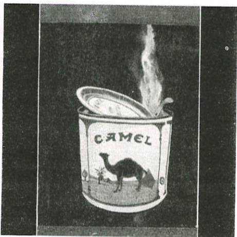
Kay Russell: Recollections: Camel Can, 2013, Watercolor, gouache, thread, watercolor monotype background, n.d.